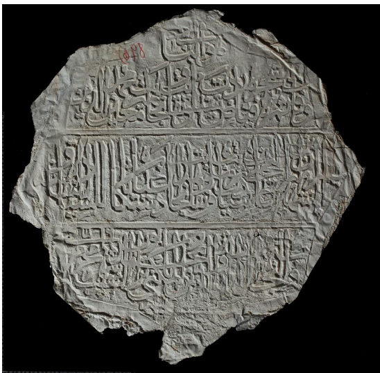
Figure 2 A paper mold from the Freer | Sackler collection.

The collection of paper molds (see Figure 2) made 90 to 100 years ago from archaeological sites in Ancient Persia includes Arabic, Cuneiform and Middle Persian languages that have not been fully translated and studied. The goal of this project was to create digital surrogates of these fragile paper objects with the technique of RTI, thus increasing the legibility of the characters on the varying surfaces of the molds. The molds will also be physically preserved by digitization and will be accessible for translation and research from anywhere in the world. This collection includes items ranging from about the size of a postage stamp up to 6' long with all variations of dimensions in between. Using the previously established workflow for RTI, two photographers/technicians would have been needed for the image acquisition of a majority of the collection, one person holding the light source and the other measuring the distance from the light to the object and triggering the shutter. By using the methods and materials described below, a single photographer can capture the RTI source images for any object less than four feet wide.