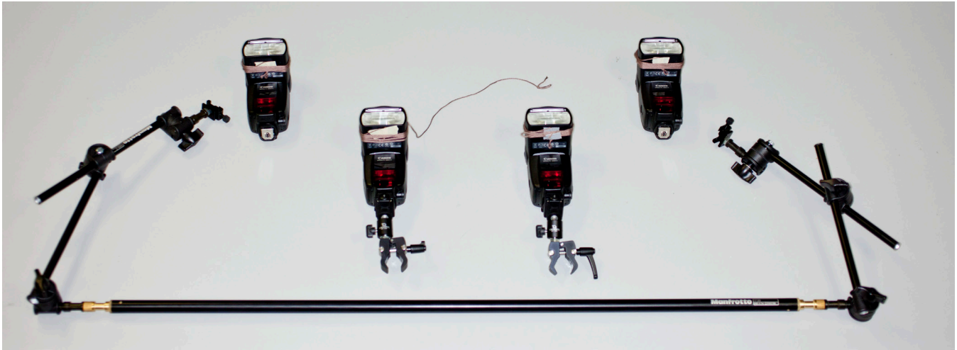
An “exploded view” of the equipment attached to the boom arm: 4 flash heads, 2 articulating arms, 2 nano clamps, 2 mini ball heads, and appropriate fasteners.