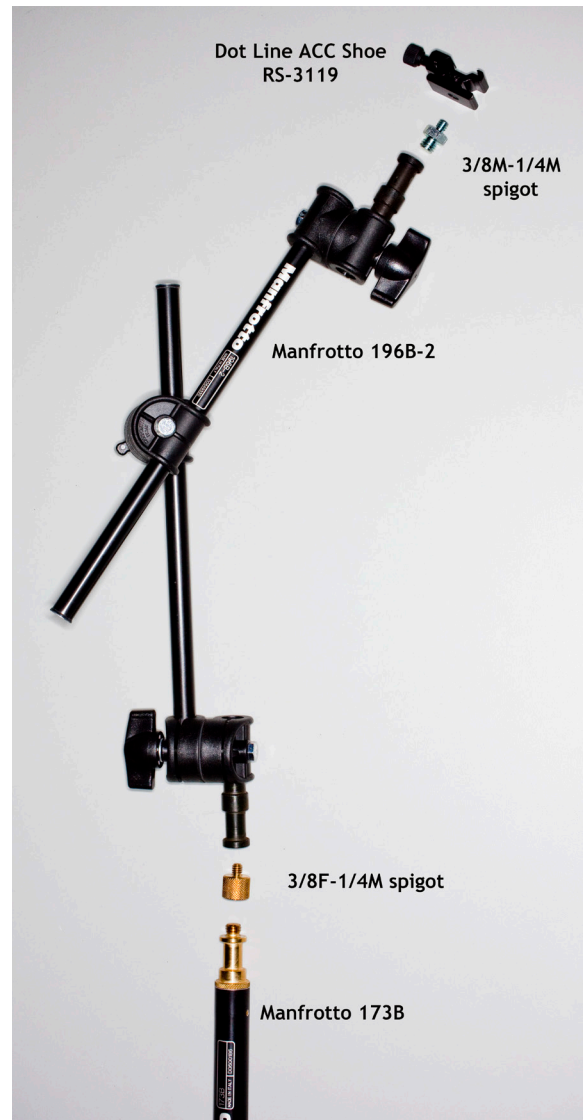
Figure 4 (right) A breakdown of parts for the two outer flashes (Flash#1 and Flash#4) using the articulating arms.

purchase them. In fact, it is hard to imagine that a complete custom set up would have worked better. The two inner flashes are attached to the boom arm using a small clamp, fastener, a mini ball head, and a cold shoe (see Figure 3). The freedom of movement of the flash head on the ball head aids in positioning of the innermost flashes. The two outer flashes on the small boom arm are attached using articulating arms, a cold shoe and the appropriate fasteners (see Figure 4). The articulating arm allows for a range of movement and flexibility in calibrating the setup. The end of the main boom arm is counterweighted with a 10 pound steel weight to prevent tipping. When assembling the QuadriFlash Mantis, we found it beneficial to line up the direction of the flashes with one of the three legs of the mini super boom. This helps with the positioning of the setup (aiming) during image acquisition, making the process faster.