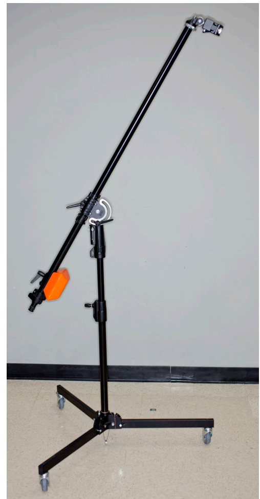
Manfrotto 025TM Mini Super Boom on wheels with column stand and counter weight.