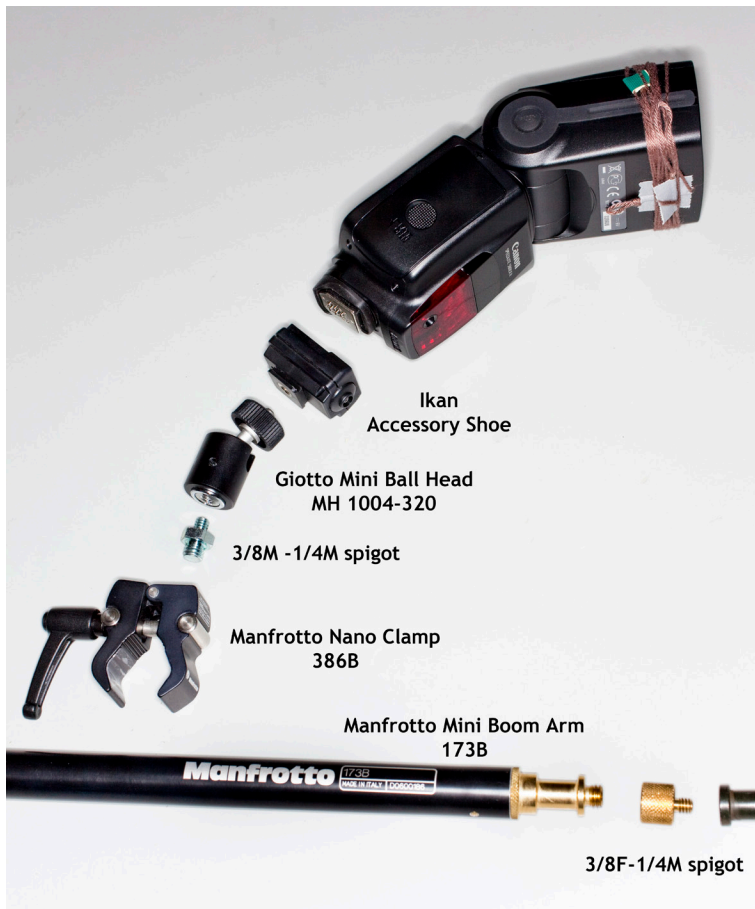
Figure 3 (above) The parts for the two inner flashes (Flash#2 and Flash#3) of the Mantis.